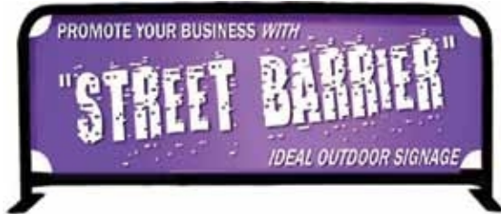
Banner with rope edges - fit into sail-tracks