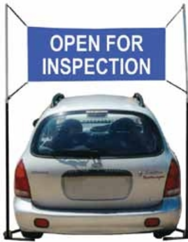
(Two) Wheel System with horizontal banner across top of vehicle