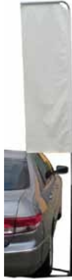
(One) Wheel System with vertical (Pennant-style) banner