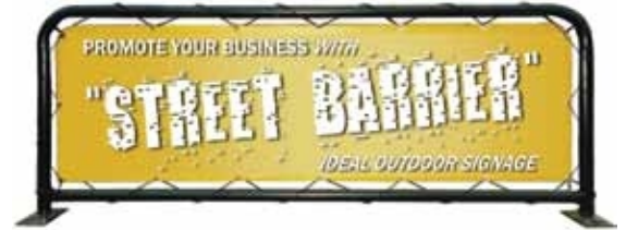
Banner with eyelets for lacing onto frame