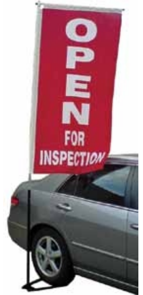
(One) Wheel System with fag-pole and "Swing-Arm Top"